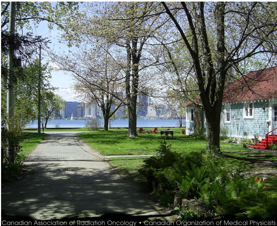
view on Toronto Island

A Sponsorship Application Form is on page 26 of this package. Please indicate which unique event you wish to sponsor, and whether you will be taking advantage of placing an ad, designed by your company, in the scientific program. Please also indicate whether you will be applying for exhibit booth space.