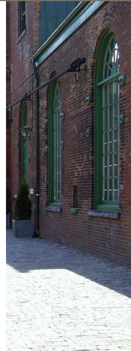
Toronto Distillery District