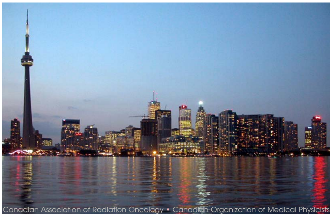
Andrew Paterson, Toronto

Please read the Exhibitor Prospectus and complete the Exhibitor Only application form, both of which are included with this package.